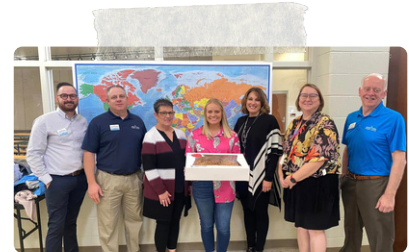
Riverside Elementary School