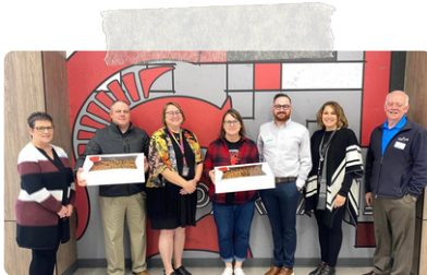
Emporia Middle School

Thank you for all you do for our community! Below are a few pictures of our fun day.