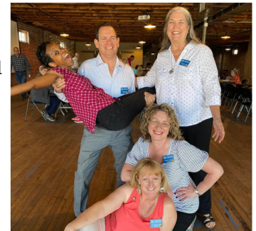
2023 Induction Class