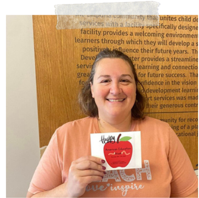
A $25 gift card winner!