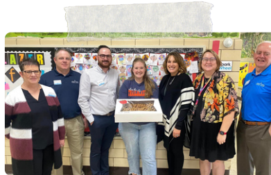
William Allen White Elementary School