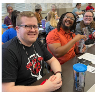
ESFCU welcomed new teachers to USD 253 during ENEA luncheon.