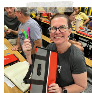
USD 386 staff excited about their new tote bag!