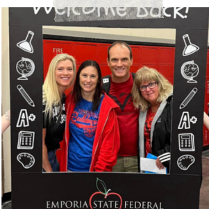
USD 253 teachers excited to begin the new year!