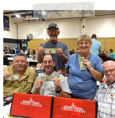
USD 251 staff were all smiles!

Below are a few pictures of our visits this year.