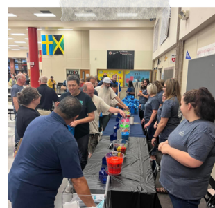
ESFCU staff hands out goodies and cash to USD 253 staff.