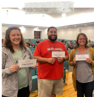
USD 284 staff collects their cash as drawing winners!